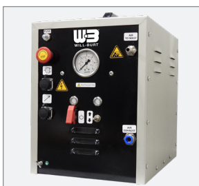
PNEUMATIC COMPRESSOR SYSTEMS & MAST ACCESSORIES ..... 10-11