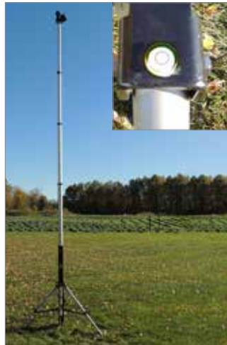
Tripod with Bubble Level