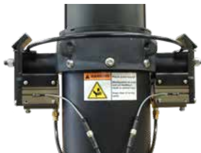
Locked Pneumatic Actuator