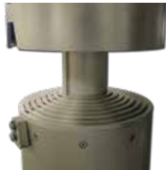
Low Nested Height