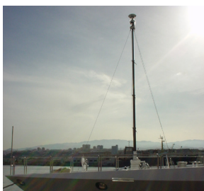
PNEUMATIC TELESCOPING YACHT MASTS ..... 9