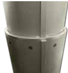
Stabilizes in transit payload