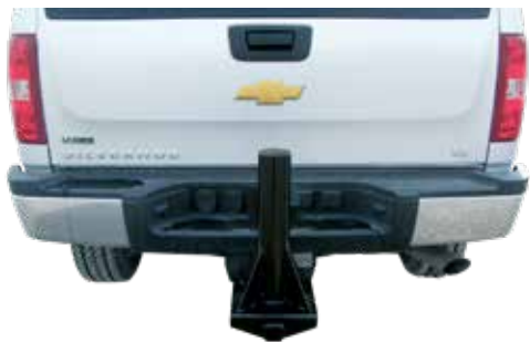
2" Removable Hitch