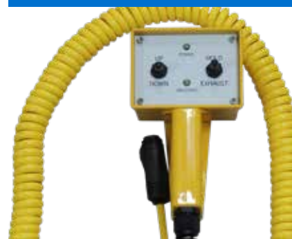
Optional Handheld Controller