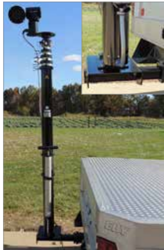
2" Hitch Mount