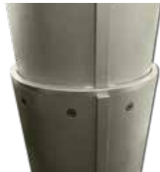
Reduced Mast Twist