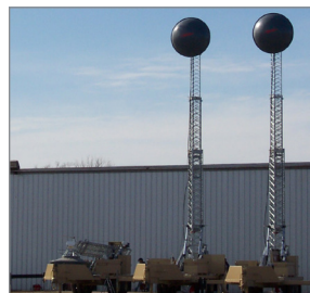
INTEGRATED TOWER SYSTEMS ..... 14-16