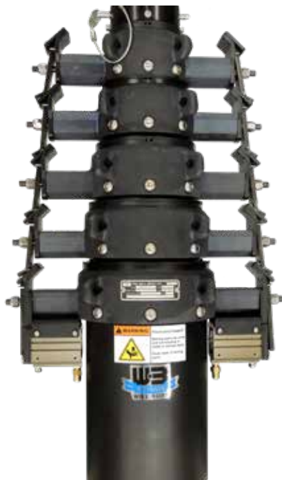
Locks and Controls Included