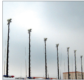
KVL AND KVR TELESCOPING CRANK MAST ..... 12