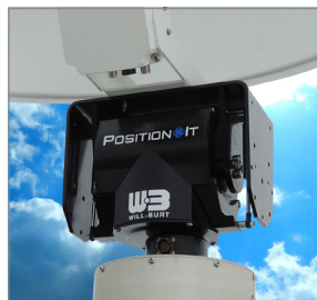
POSITIONERS AND CONTROLLERS ..... 17