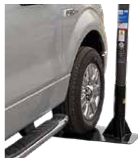
No Guylines Required