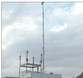
PNEUMATIC LOCKING TELESCOPING MASTS ..... 7-8