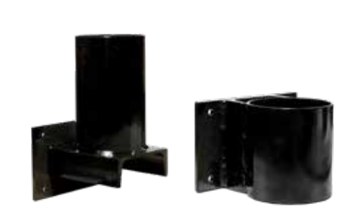
Shelf and Support Brackets