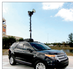
INFLEXION™ ROOF-MOUNTED TELESCOPING MAST ..... 13