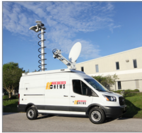
PNEUMATIC NON-LOCKING TELESCOPING MASTS ..... 4-5