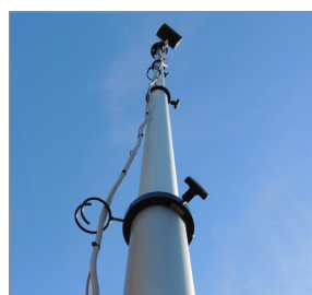
PORTABLE MASTS ..... 18-19