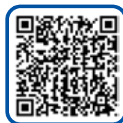
Download Product Brochure