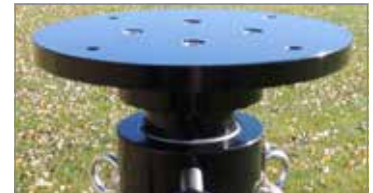
Interchangeable Payload Adaptors Stub and Stub Plate Shown