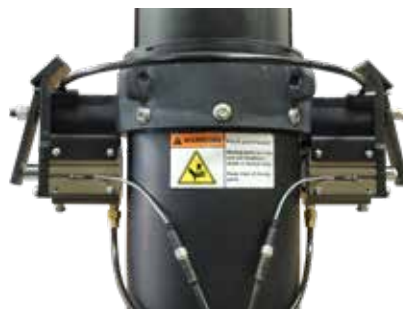
Unlocked Pneumatic Actuator