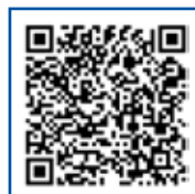
Download Product Brochure