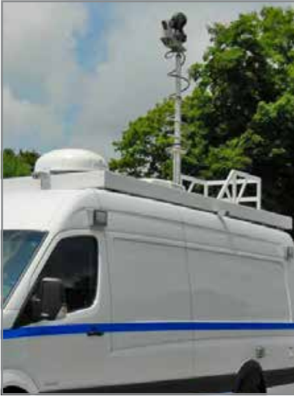
Inflexion™ Roof-Mount, Fold-Down Mast

Will-Burt's video systems have been designed for integration into the wide variety of elevation and light tower solutions. Video solutions have been specifically designed for many industries such as Fire and First Responders, Broadcast, Security, Police, Towing, Oil and Gas, Mining and Construction. Will-Burt can also design custom packages to meet your unique requirements.