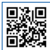
Visit Corporate Website