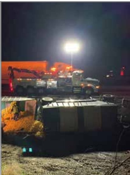
Night Scan® HDT Heavy-Duty Towing Light Tower