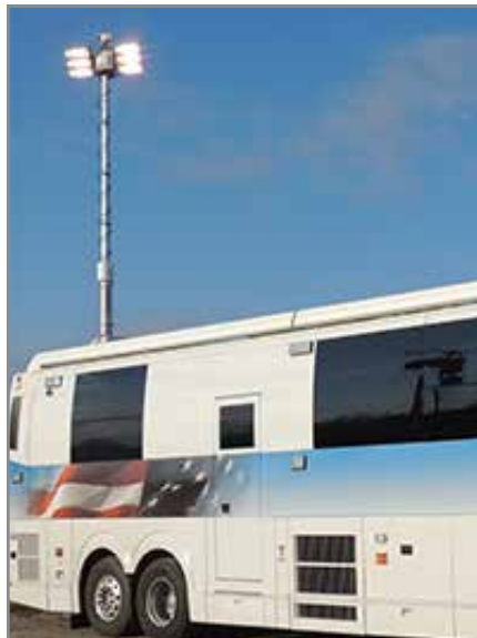
Night Scan® Command Center Application