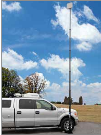
Hurry Up Portable, Push Up Mast