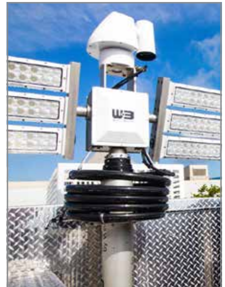
Night Scan® Light Tower with Camera