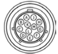
Image to show twisted pair data cables for clarity with pin-out table