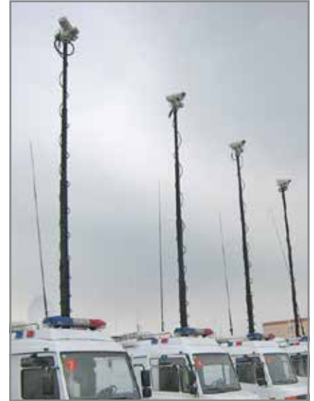
GEROH KVL Robust, Crank Mast